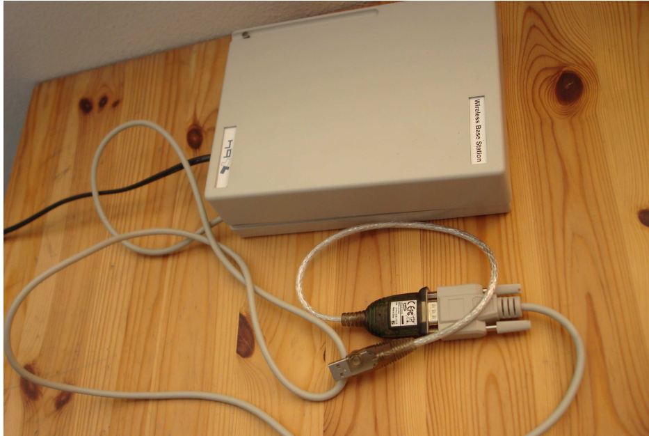
Fig. 1 USB-to-Serial connected to the Antenna

Then, plug the USB end of the USB-to-Serial cable to the USB port on the computer server as shown on figure 2.