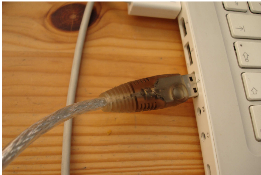
Fig.2 USB-to-Serial cable connected to USB port on the computer server.

Then, plug the USB end of the USB-to-Serial cable to the USB port on the computer server as shown on figure 2.