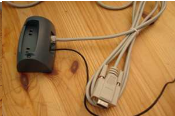
Fig.4 Serial connected (for off-line terminals)

Finally, connected both the Antenna and the AC adapter to the power socket as shown in figure 5.