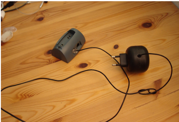
Fig.3 AC adapter plugged to the base (charger)

Then plug the base with the AC adapter, as shown in figure 3 (use the serial to plug an off-line terminal as shown below in figure 4).